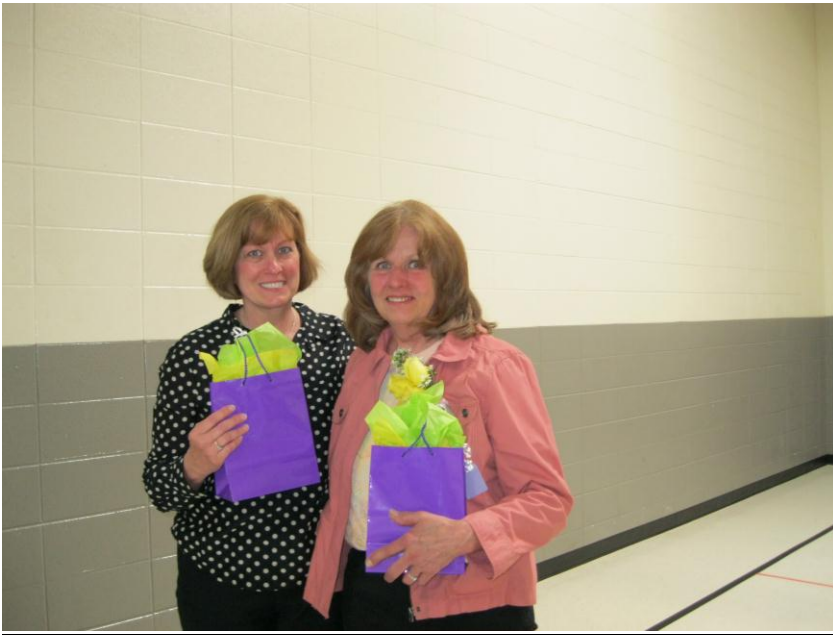
Thanked those with many years of service to Mid-Valley...