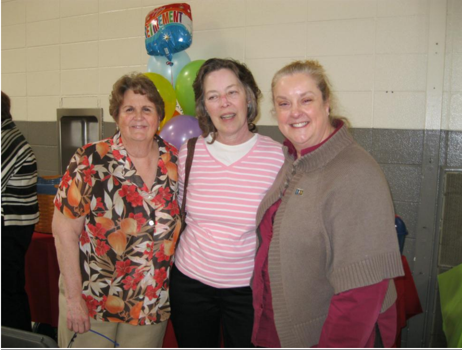
We saw folks from our past... (and present)....